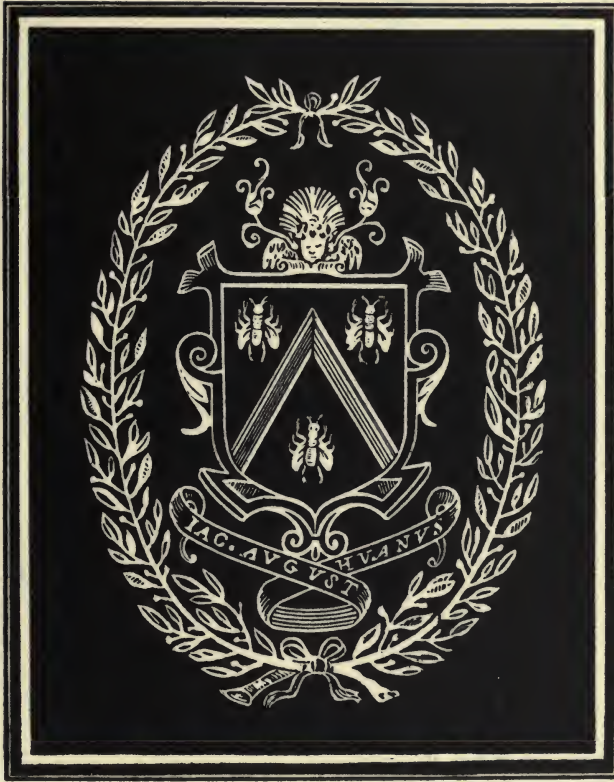
THE FIRST ARMS OF DE THOU.